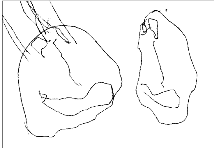
Figure 1 A drawing made by the patient at 5 years of age. The mother is drawn on the left side, while the doctor is drawn on the right side.